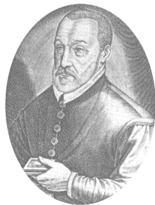
Blaise de Vigenère (1523–1596)

We therefore continue here with Kasiski's algorithm .